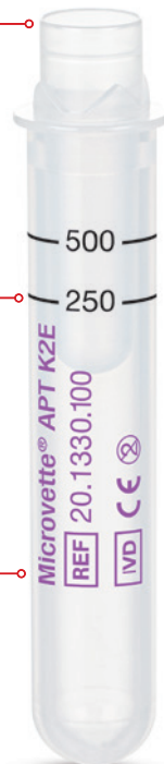
Microvette® APT 500

Time-saving analysis – direct and hygienic primary tube. Newly developed membrane cap also guarantees safe sample transport and shipping.