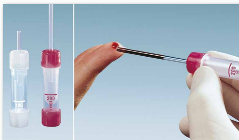
Microvette® 100/200 Blood collection with End-to-End capillary