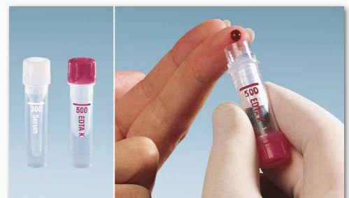
Microvette® 300/500 Blood collection with collection rim

More information is available on request.