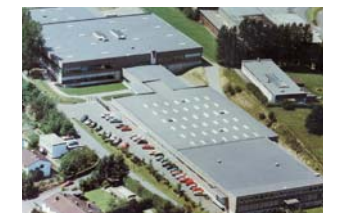
Wiehl, North Rhine Westphalia, Germany