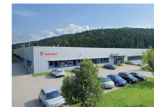
Klingenthal, Saxony, Germany