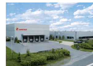
Brand-Erbisdorf, Saxony, Germany