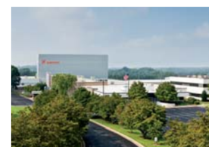
Newton, NC, USA