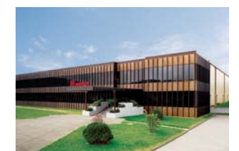
Hemer, North Rhine Westphalia, Germany