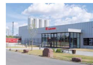
Rheinbach, North Rhine Westphalia, (Germany)